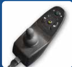
Dynamic Shark Controller

The Jazzy® Elite HD features two-motor, front-wheel drive technology and heavy-duty construction. The Jazzy Elite HD features 14" drive wheels for enhanced outdoor performance combined with a front-wheel drive design to provide tight turns for optimal indoor maneuverability in small spaces. Large front wheels add extra absorption for superb climbing capabilities and combine with front anti-tip wheels for handling various terrains with ease.