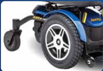
Front-wheel drive design